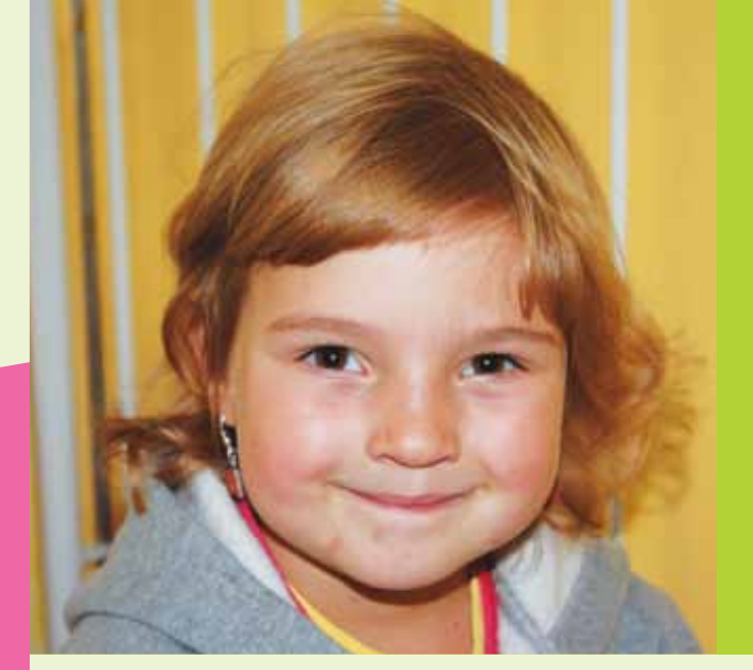
Child at a Tuberculosis clinic in Lviv, Ukraine

Firefly Children's Boutique Jack Rabbit Creations Munchkin Safari Ltd.