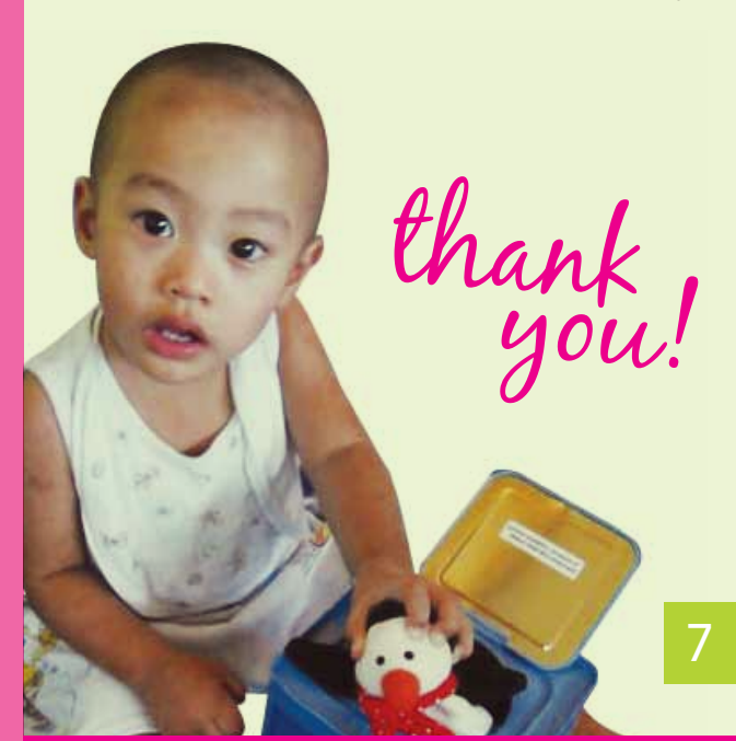
Baby playing with toy donated by Jack Rabbit Creations