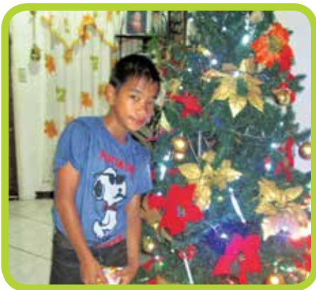
▲ He loved seeing this Christmas tree and urged me to take pictures