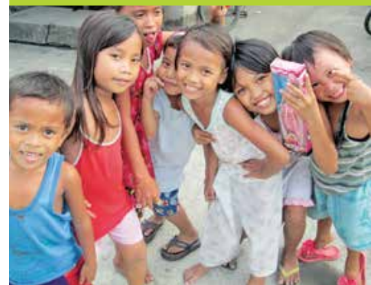
▲ Children on the street in Manila.

Maya's Hope wants to provide these children with the love and support they need to grow into happy, healthy, productive adults.