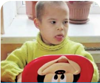
At the orphanage in Ukraine

There is a little boy in Ukraine who spends most of his time in a crib. Whenever he goes into the playroom, he picks up Mickey Mouse. Mickey didn't just bring him joy, Mickey brought him hope.