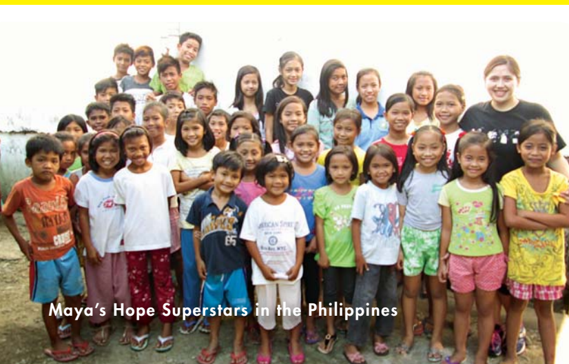
Maya's Hope Superstars in the Philippines

Thank you for believing in the potential of the children we help at Maya's Hope. You are making miracles happen.